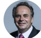
Neil Parish MP Member of Parliament for Tiverton and Honiton