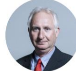
David Zeichner MP Shadow Minister for Environment, Food and Rural Affairs