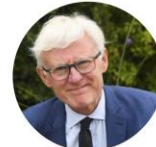
Sir Norman Lamb Founder of the Sir Norman Lamb Mental Health and Wellbeing Fund