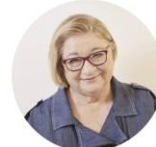
Rosemary Shrager Chef, Author and TV Personality